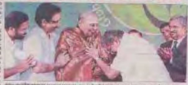
വയലാർ രവി (മധ്യത്തിൽ) കേരളത്തെ ആയുർവേദ ചികിത്സയുടെ ആഗോള കേന്ദ്രമാക്കണം എന്ന് പറഞ്ഞു.

കേരളത്തെ ആയുർവേദ ചികിത്സയുടെ ആഗോള കേന്ദ്രമാക്കണം എന്ന് വയലാർ രവി പറഞ്ഞു. ഇദ്ദേഹം കേരളത്തിലെ ആയുർവേദത്തിന്റെ മഹിമയെക്കുറിച്ച് സംസാരിച്ചു.