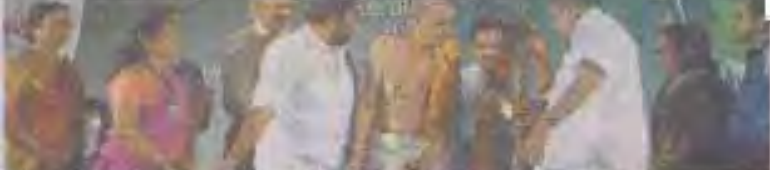
കണ്ടറിയം, ആയുർവേദ മഹിമ